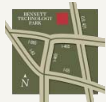
Located on 106th Street and U.S.421 Just North of I-465

Positioned on the Northwest quadrant of the I-465 loop, this location offers easy access to several major thoroughfares. It's the perfect place for your business park - minutes from I-465 - Bennett Technology Park has unsurpassed access to your growing work force. Call us at 573-6050 for leasing information and property details.